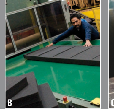
Your layout is then transferred to your choice of foam to be cut using either (A) Water Jet Technology (B) Die Cut Technology or (C) CNC router technology.